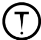
D2B - Toxic